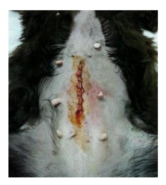
Fig. 7: Hysterectomy.