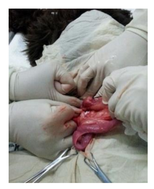
Fig. 6: Ovariectomy.