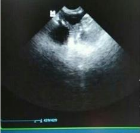
Fig. 1-2: B-ultrasound image results of abscess of dog.